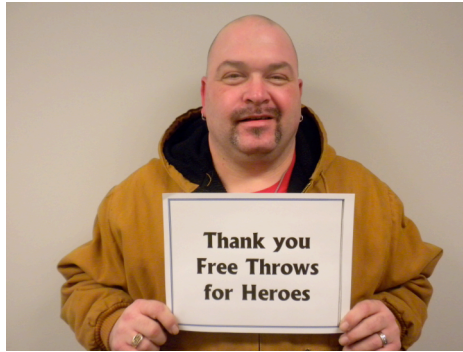
Back bills paid.... Work clothes and boots purchased..... Now Employed