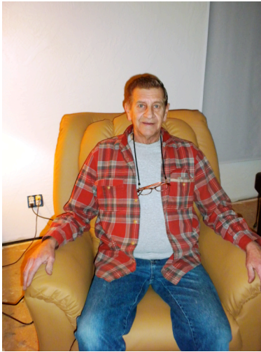
Back Injury- Purchased lift chair w/ heat and vibration... Now Employed