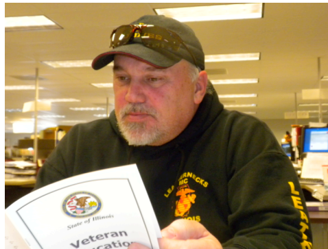
Past due bills paid.... Now employed